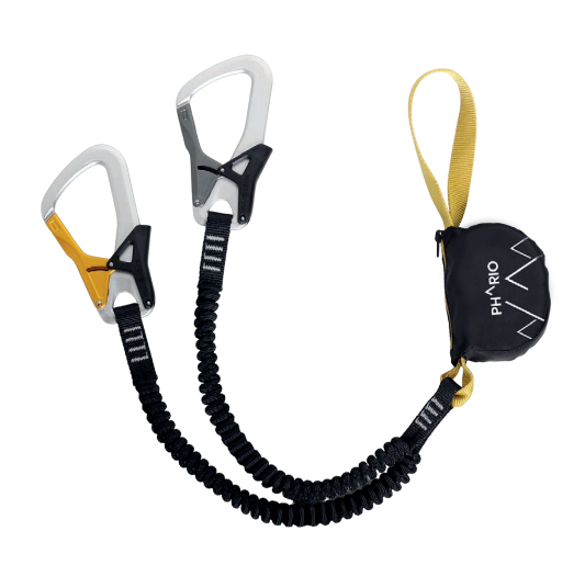
PHARIO PALM C2317YB00