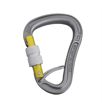
BORA GP screw K0107