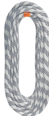
STATIC R44 NFPA 13 R0460WB