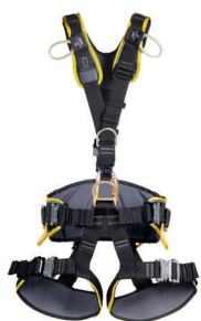
EXPERT 3D SPEED STEEL