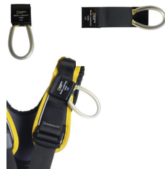
lanyard parking attachment element