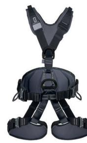
EXPERT 3D SPEED black