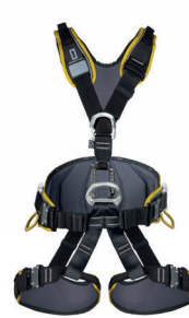
EXPERT 3D SPEED