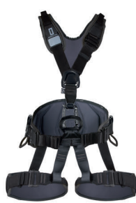
EXPERT 3D STANDARD black