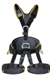
EXPERT 3D STANDARD