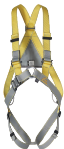
BODY II SPEED (W0071)