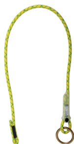
PATRON LANYARD STEEL RING (W2112) length 1.25 m / 1.5 m rope Ø 11 mm weight 292 g / 315 g EN 795B