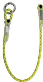
PATRON LANYARD ALU RING (W2111) length 1.25 m / 1.5 m rope Ø 11 mm weight 215 g / 235 g EN 795B