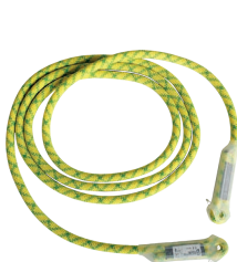
PATRON LANYARD (W2117) length 3.5 m / 5.5 m \varnothing 11 mm weight 345 g / 540 g EN 795B