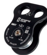
PULLEY MIKY (RK806BB00) strength 28 kN for ropes \varnothing max. 13 mm weight 105 g EN 12278