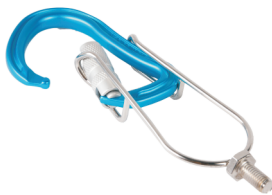
head- for HECTOR and BORA connectors W0024XX01