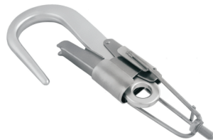
head- for BIG CONNECTOR W0024XX02