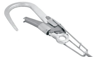
head- for CONNECTOR GIGA W0024XX03