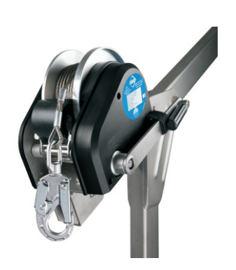
PLW winch A4064XX30 Steel wire 30 m 18,5 kg