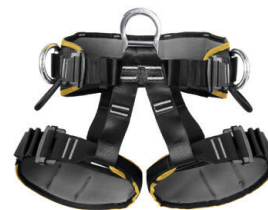
SIT WORKER III